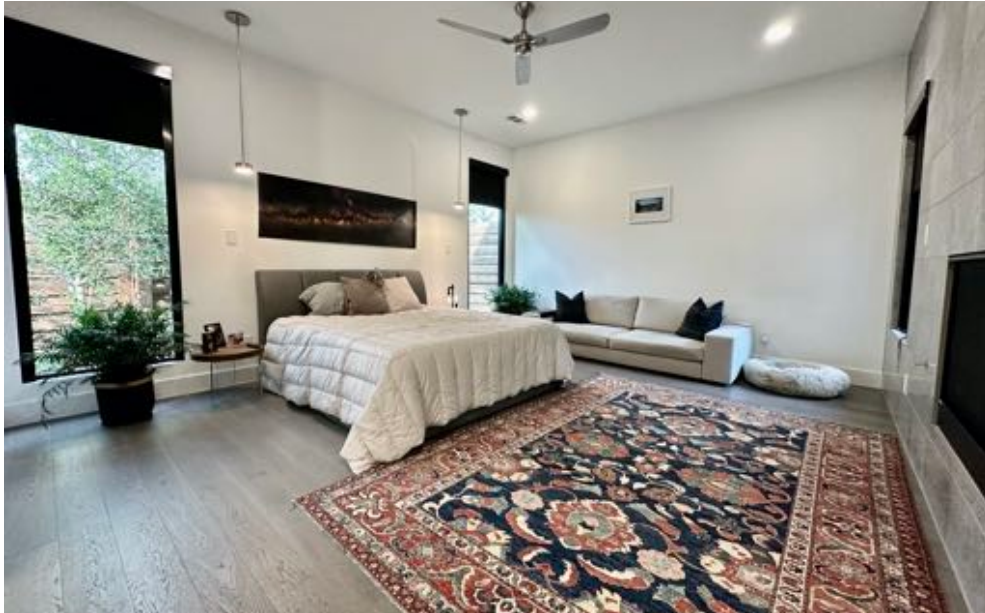
Spacious 1st Floor Primary Suite with Sitting Area & Fireplace