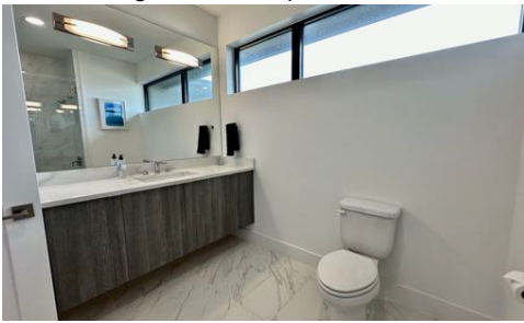
Upstairs Bathroom 3