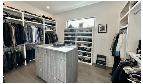
Primary Closet with Island & Window