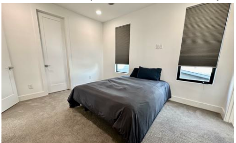
Upstairs 3rd Bedroom