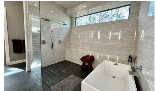
Hammam Inspired Primary Bathroom