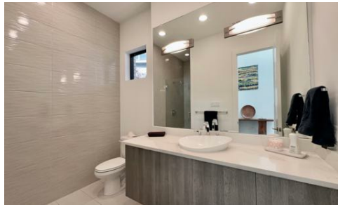
Downstairs Full Bathroom