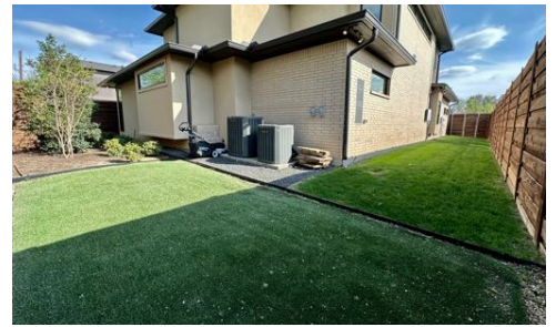
Turfed Backyard & Grassed Dog Run