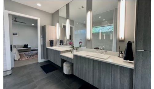
Primary Bathroom with Double Vanities