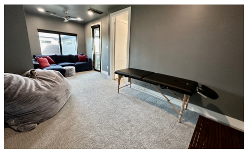
Upstairs Media/Exercise/Bonus Room