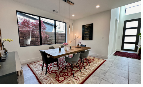
Dramatic Dining Area with Japanese Maple