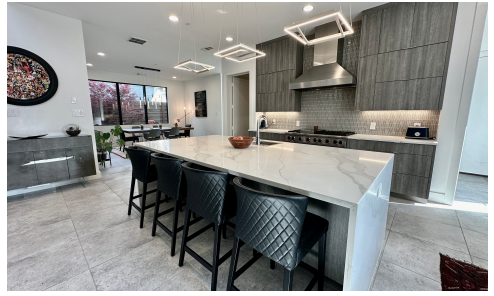
Waterfall Island Perfect for Entertaining