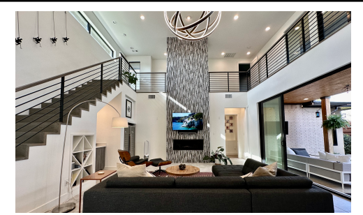
Stunning, Open Living Area with Gas Fireplace