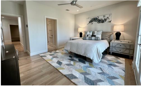
Upstairs Bedroom #4 Suite